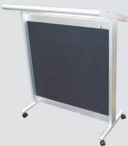
Model L900 Wide in Deep Satin Silver with Coal Black dress panel.

The established industry standard lectern. Ageless elegant design. Over 15,000 in use in Australia and throughout the world. Used by AV hire companies, mid size hotels, businesses and all levels of government.